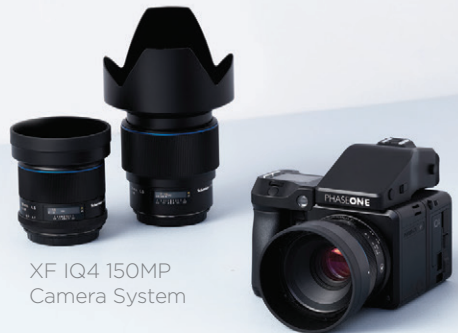
XF IQ4 150MP Camera System

For more information or to schedule a demo email: info@megapixelsdigital.com